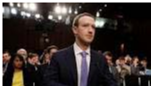
Mark Zuckerberg's Facebook Apology Is the Linguistic Equivalent of 'S#*t Happens'