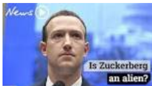
Mark Zuckerberg's toughest questions in Facebook grilling