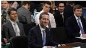
Facebook founder Mark Zuckerberg goes before Congress — again