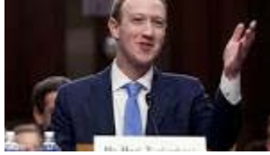
Mark Zuckerberg emerges unscathed by congressional grilling as Facebook hearing ends