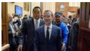
Mark Zuckerberg unscathed by US congressional grilling, Facebook's stock rises 4.5 per cent