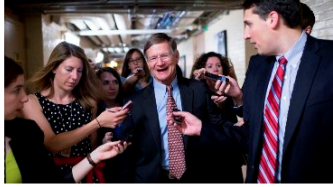
U.S. Congress/Science Committee News (Not Good News)