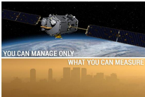
NASA's Orbiting Carbon Observatory-2, set to launch July 1, will revolutionize carbon dioxide measurements.

Earth Observing NASA Space Fleet, as of 2014